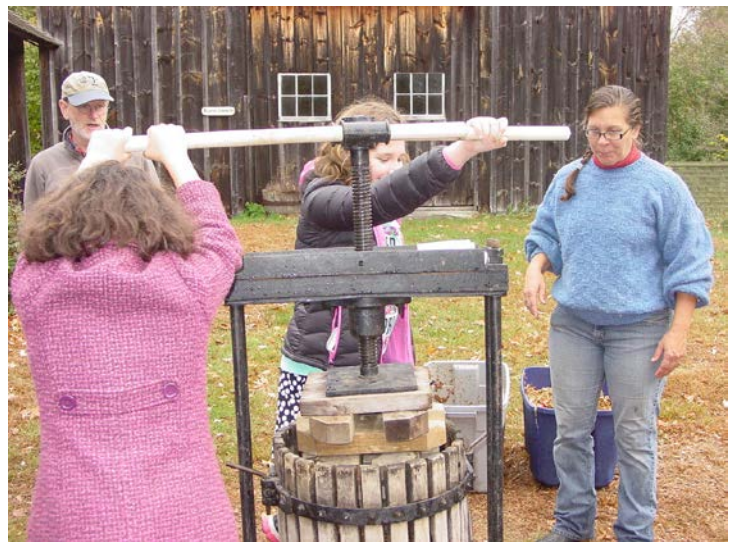
Starting with upper left going clockwise: Joshua's Trust Headquarters – the Atwood House; Cider Pressing at the Atwood Farm; Owen's Mere Trailhead sign.