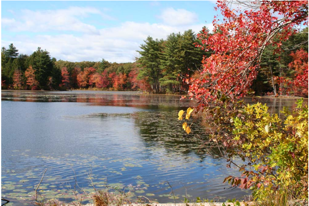
A Fall Day on Lake Marie, Allanach-Wolf Woodlands, Windham, CT