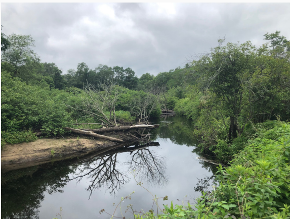
One of the beautiful views you can discover at Church Farm Preserve. Keep an eye on your email and social media for an official opening date for the new trail!