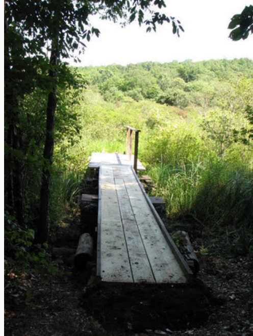
Spring flood waters had damaged the existing bridge leading the the Church Farm river boardwalk. EASTCONN students assisted the property stewards to repair this key entry point to this property.