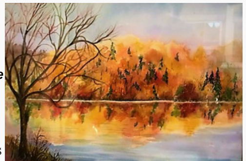
Painting of Echo Lake By M.J. Hesche