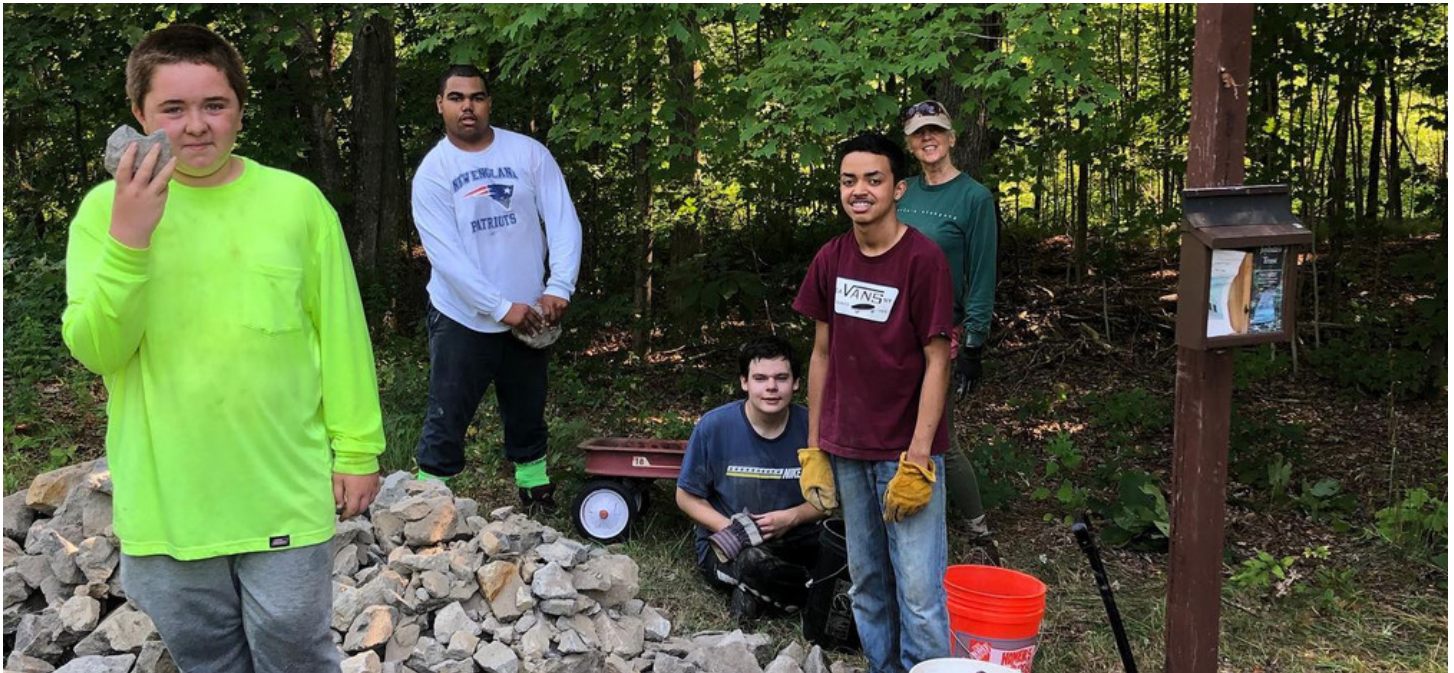
A big project to shore up the boardwalk at Church Farm got a huge helping hand from participants in EASTCONN'S summer job program. From area high schools, the young men worked as a team and created two gabion baskets or rock-filled wire mesh supports. It was one July day in a four-week program. Joshua's Trust salutes with gratitude EASTCONN, supervisor Norma Gervais, and the six participants. (Pictured above.)