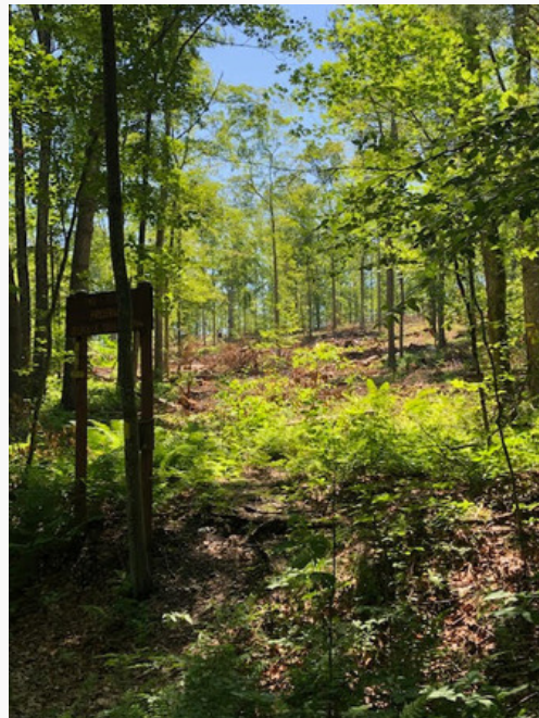
The Gypsy Moths had defoliated the majority of red oak trees on the Two Sisters Property. As a safety precaution and to encourage diversity through forest management, a timber harvest was conducted. The trails are now reopened and you will likely see more birds around! Forest management has shown to be great for birdlife!